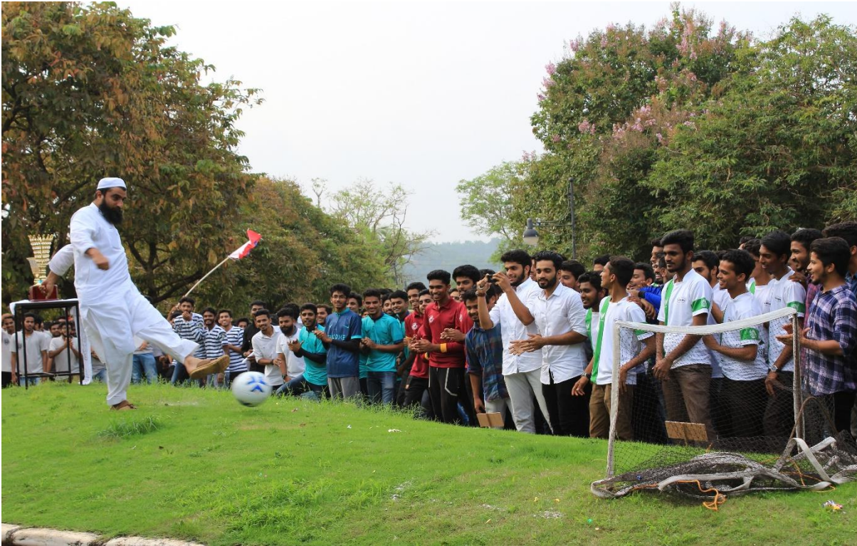
PAPL 2018 Inauguration