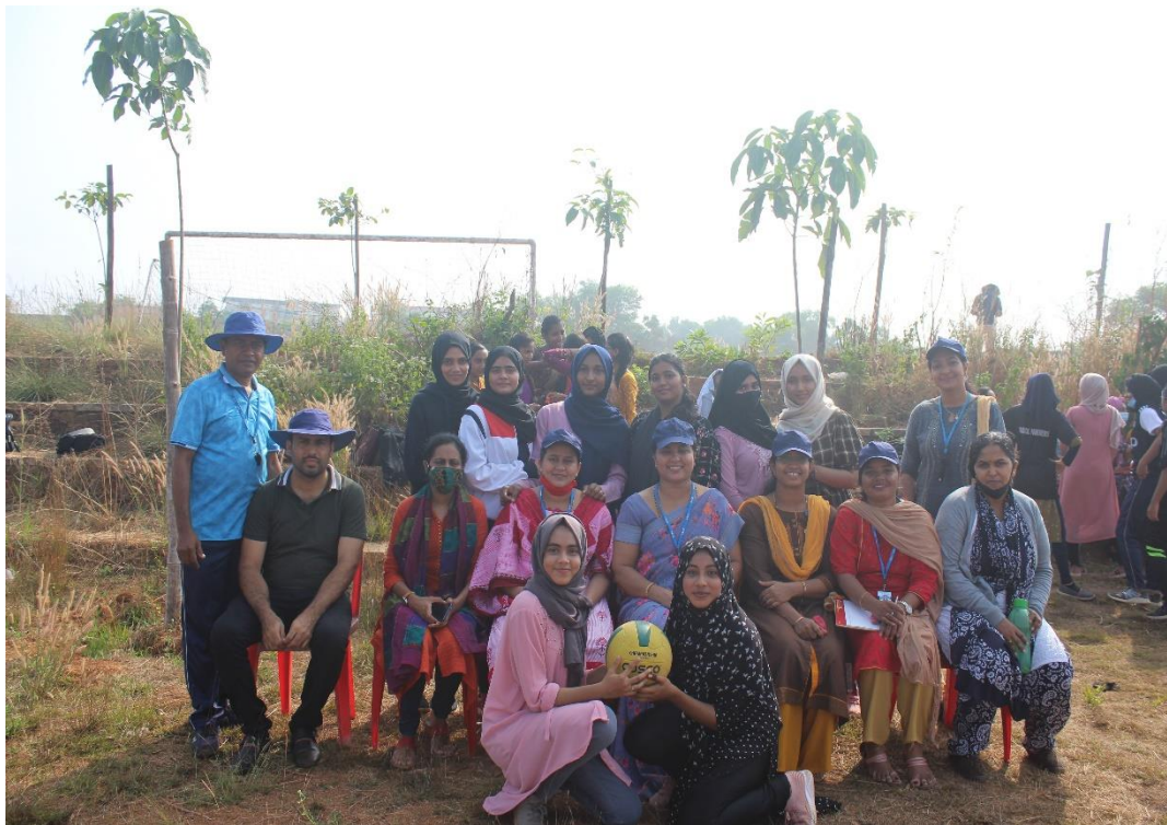
Throw Ball Winners