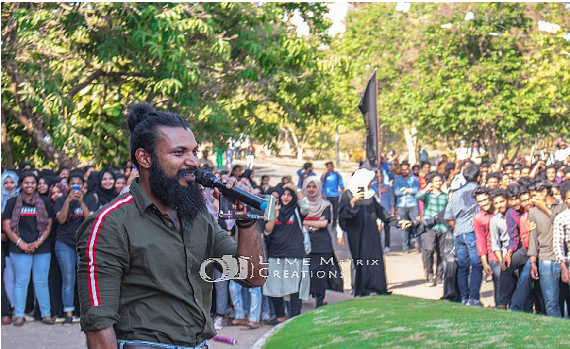
PAPL 2018 Inauguration