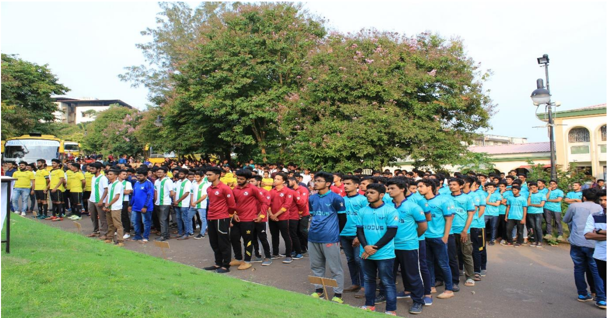
PAPL 2018 Inauguration